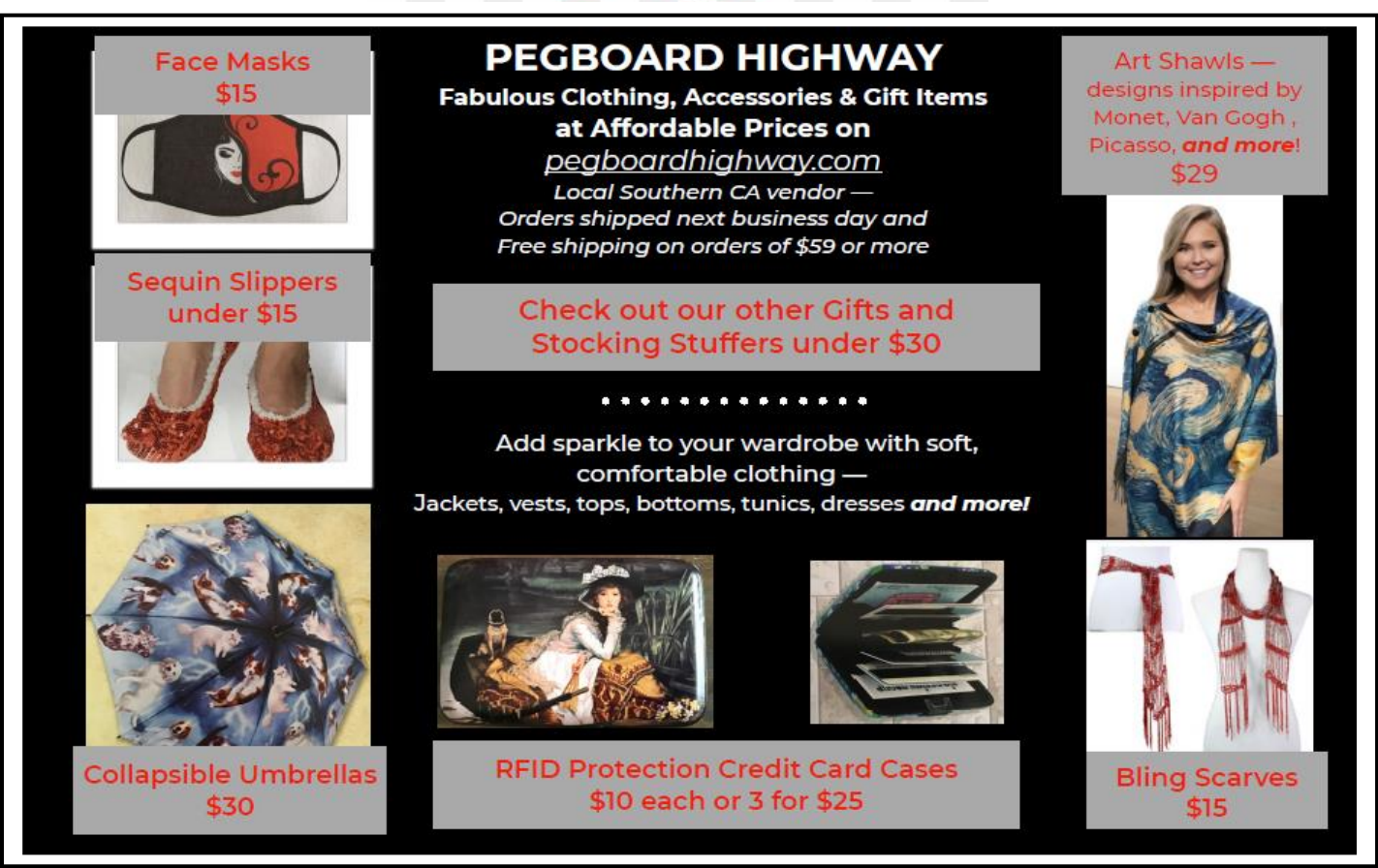
Web site: pegboardhighway.com